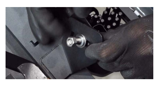
14. Using a 13mm wrench, install the SS3 Pods onto the brackets.