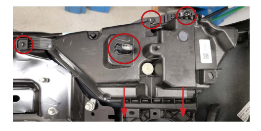
12. Remove the fog lamp by disconnecting the fog lamp connector. Then remove the four T30 torx screws and pull the fog lamp up and out of the bumper. Remove the 13mm bolt on the strut, this bolt will be reused.