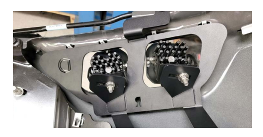
15. Install the fog bracket using the factory hardware previously removed.

NOTE: There will be two extra torx screws.