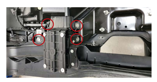
11. Disconnect the radar connector and remove the radar and bottom trim on the bumper by removing the three 13mm bolts on either side of the bumper. Pull the radar and trim away from the bumper.