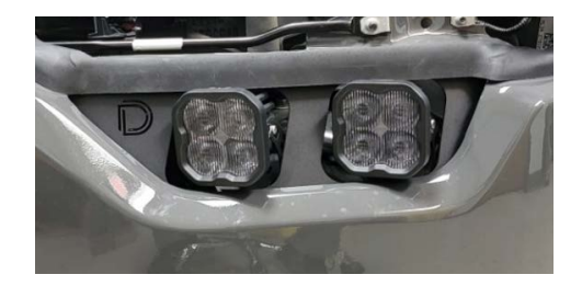
16. Repeat steps 12 through 14 on the opposite side of the bumper.