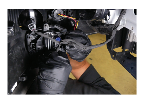
11. Plug the connector on the turn signal housing into the factory turn signal connector. Then reconnect the sidemarker and fog light connectors.