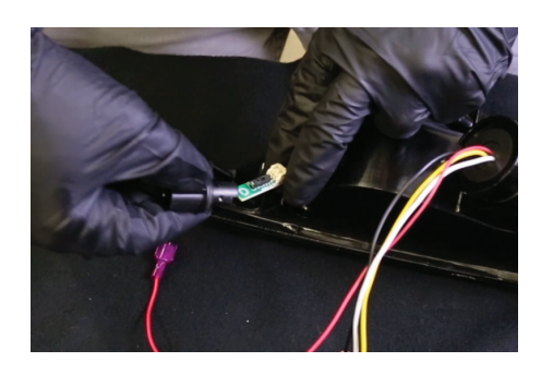
8. Once the blink rate has been set, insert the switch into the factory sidemarker socket. Reinstall the socket back into your new turn signal housing.