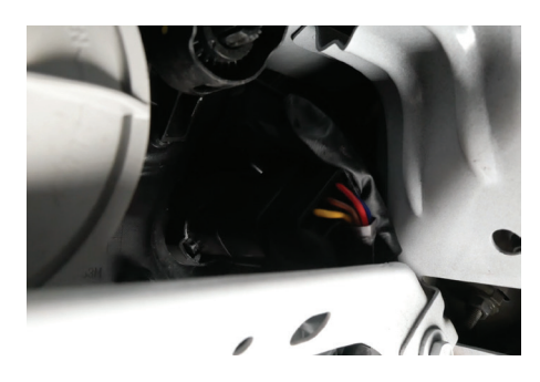
12. Unplug the headlight connector by depressing and pulling straight out. Plug the DRL wiring harness in line between the headlight and headlight connector.