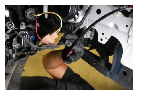
13. Then connect the red wire from the turn signal housing to the spade connector on the wiring harness.

14. Test thoroughly, and secure all wires. Repeat the process for the other side of the vehicle and reinstall the belly pan onto the vehicle using the original hardware.