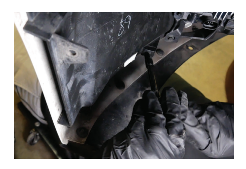
3. Looking at the fog light bezel, unplug the factory turn signal, sidemarker, and fog light connectors by depressing and pulling straight back. Then remove the six 7mm screws holding the fog light bezel in place.