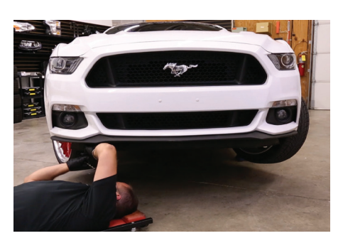
2. Remove the belly pan from underneath the vehicle. To do so, remove the 12 7mm screws on the outside edge, four 7mm screws on the belly pan itself, and six plastic rivets on the outside edge to remove the belly pan.