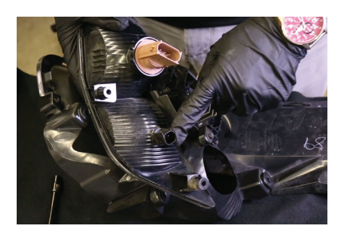
6. Remove the sidemarker socket from the factory turn signal housing and remove the bulb. The socket will be used with your new turn signal housing.